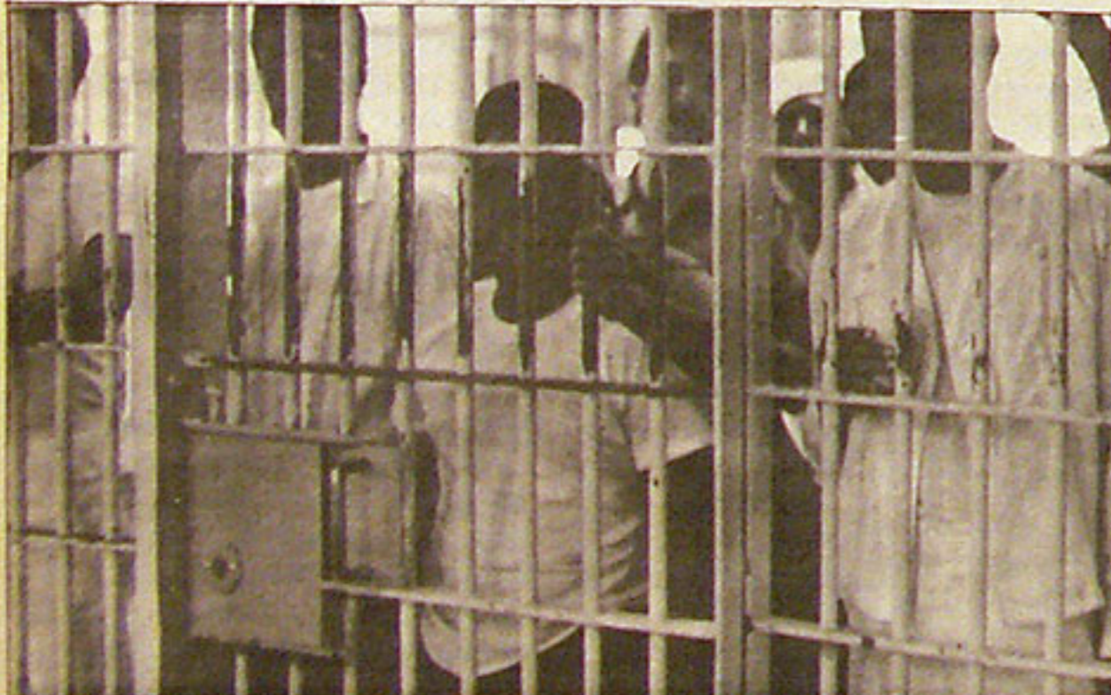
"The U.S. government has always used the death penalty as a tool of genocide against Black people. Fifty-four per cent of the people executed since 1930 have been Black."

A demonstration in support of Graham and Allen was held outside the State Building December 5, the first day oral arguments were presented to the high court.