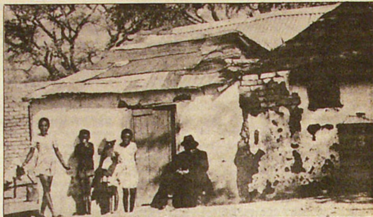
Black people in Namibia are forced to live in extreme poverty under the White South African regime.

The day before, 30 demonstrators were arrested after about 150