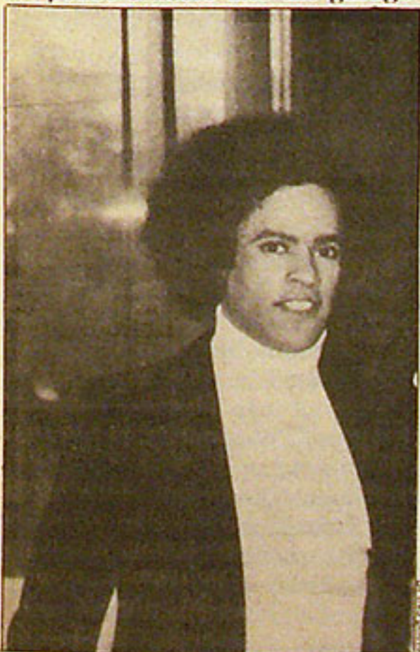
HUEY P. NEWTON

Another example of the stepp- CONTINUED ON PAGE 15