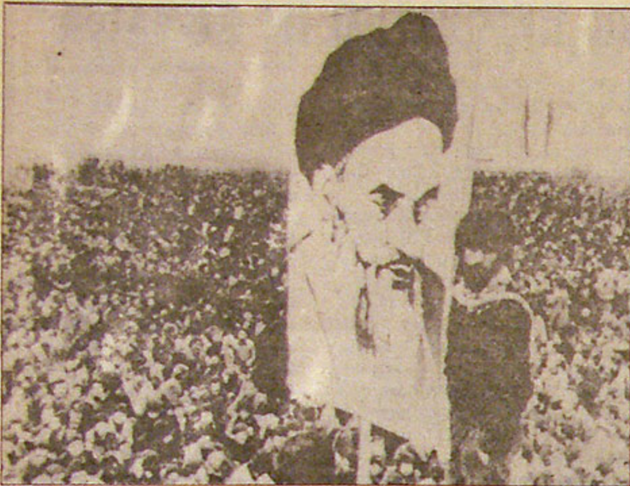
Hundreds of thousands of demonstrators in Tehran, capital of Iran, have taken to the streets to protest the Shah's oppressive regime.