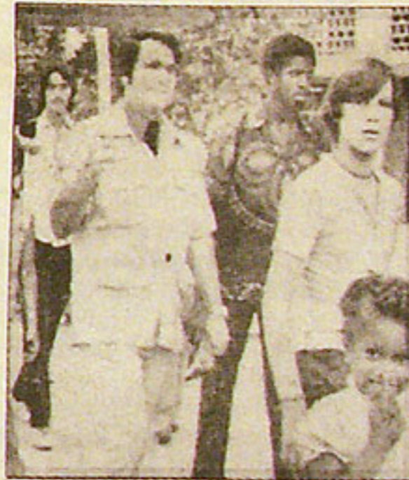
Rev. JIM JONES leading Peoples Temple protest.