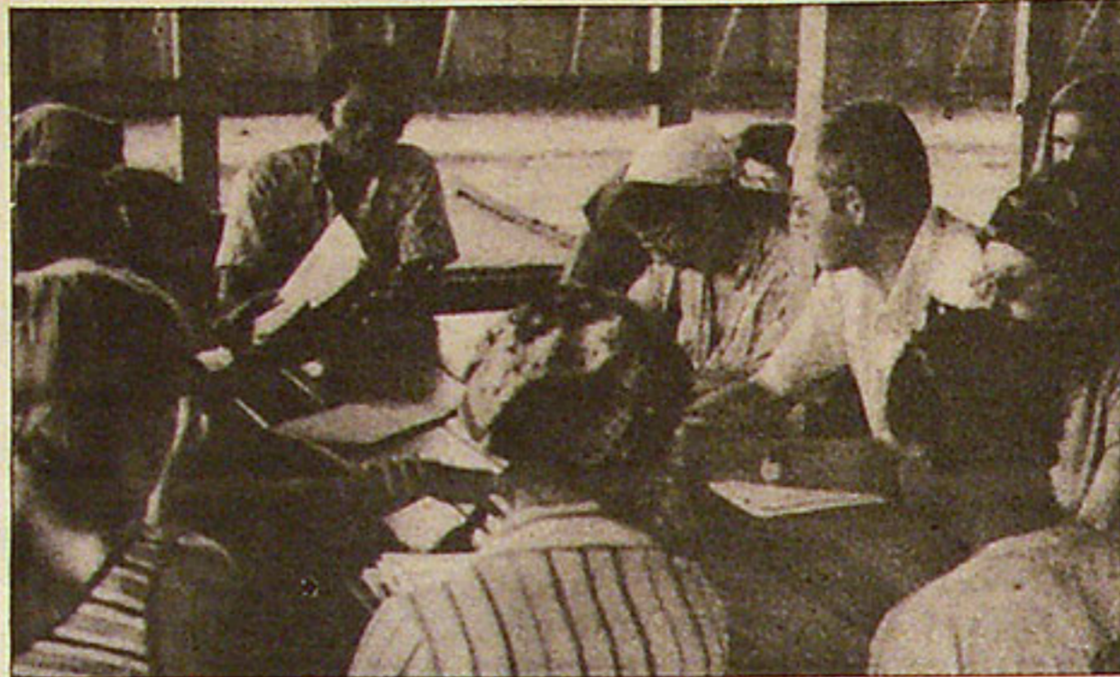
Class at Jonestown, Guyana, before its destruction.

The presently available evidence, based on interviews with knowledgeable sources in media and government, casts serious doubt on Justice Department claims that the practice — which was widely used by the FBI and others for more than four decades — ended prior to 1976 with its exposure during Senate hearings on domestic intelligence abuses.