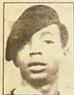
BOBBY HUTTON Assassinated: April 6, 1968

The brother of Alprentice "Bunchy" Carter, the founder of the Southern California Chapter of the BPP, Arthur was shot and killed in Los Angeles by agents of the U.S. government.