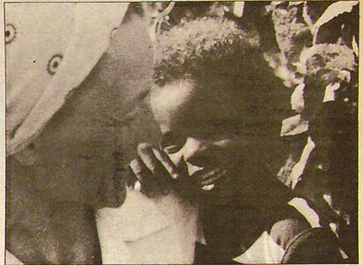
Happy people, like the woman and child above, were murdered in Jonestown.

A: Two figures were quoted to me. One was $450 per body and one was $600, and that's just for