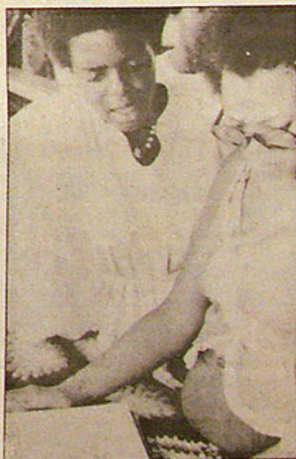
Jonestown residents were hard at work creating a new and better society.

Q: Do you believe that all those people killed themselves?